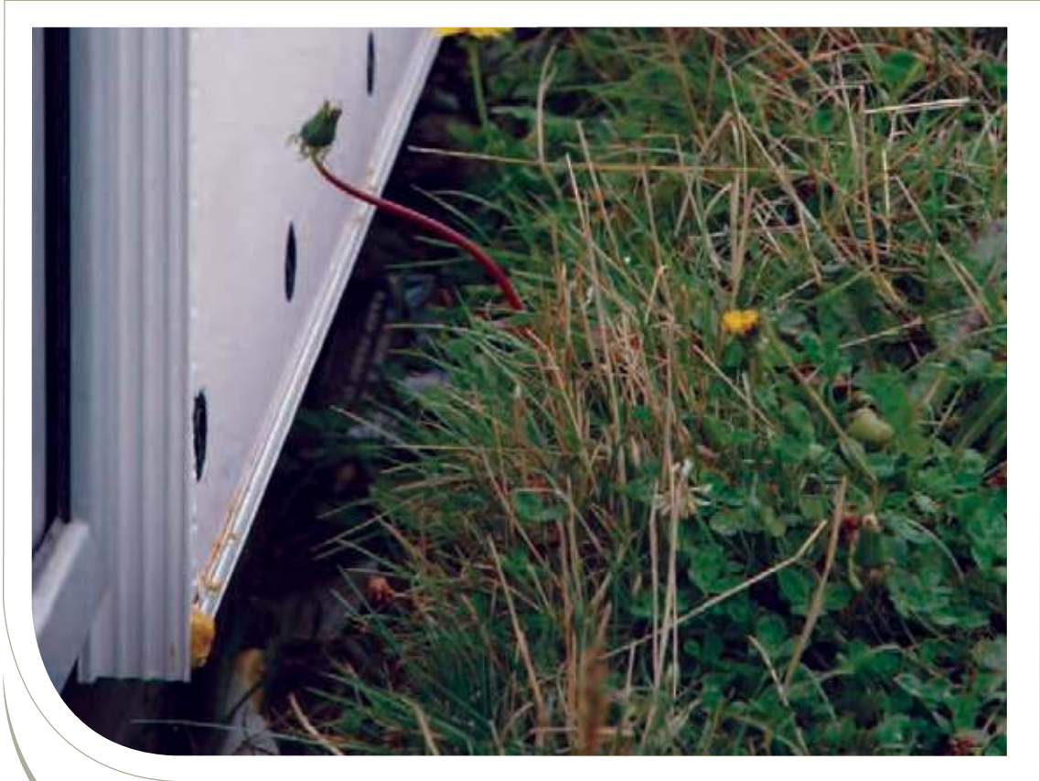
Figure 7.1 The set-out of the slab levels for this building means that the finished slab is below the natural ground level around half of the building perimeter.